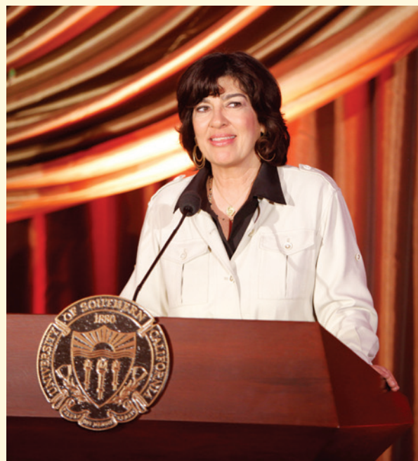
2012: Christiane Amanpour,* award-winning news correspondent