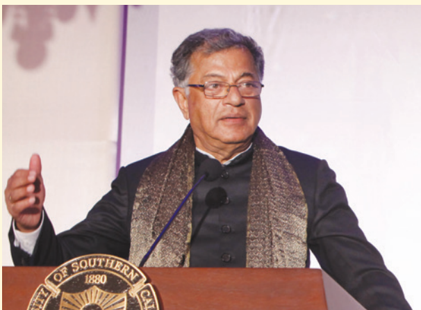
2011: Girish Karnad, acclaimed actor, director, and playwright