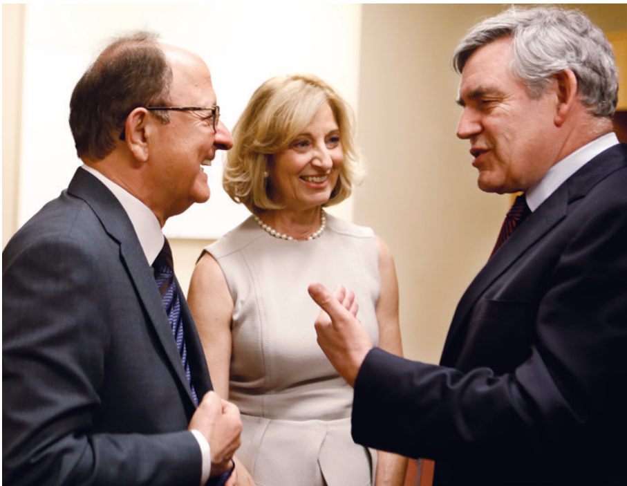
TOP: Former secretary of defense Robert Gates, now chancellor of the College of William & Mary, arrives on campus to offer a 2012 installment of the USC President's Distinguished Lecture series.