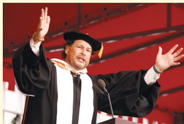
2014: Marc Benioff,* USC trustee and alumnus, and CEO of Salesforce