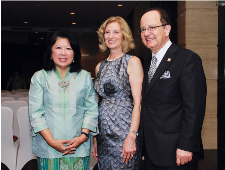
President and Mrs. Nikias meet with Mari Pangestu, the Indonesian minister of tourism and creative economy, during the 2014 delegation visit to Indonesia and Singapore. Pangestu, who is also a USC parent, spoke at an alumni reception in Jakarta.

educational diplomacy and building research partnerships between his country and the United States. Nikias also offered a keynote address at the Mexican Council of Foreign Relations on the subject of educational diplomacy.