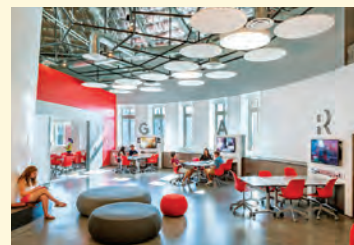
"The Garage," Iovine and Young Academy (at Tutor Campus Center) Established 2013