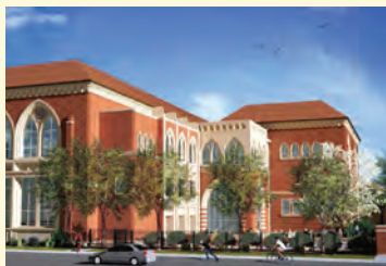
Gloria Kaufman International Dance Center 60,000 square feet Groundbreaking 2014