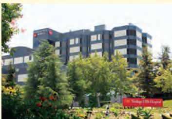
Verdugo Hills Hospital (Acquisition) Acquired 2013