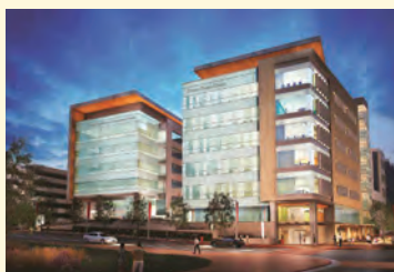
Norris Healthcare Consultation Center 116,700 square feet Groundbreaking 2014