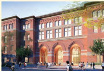
Michelson Center for Convergent Bioscience 190,000 square feet Groundbreaking 2014