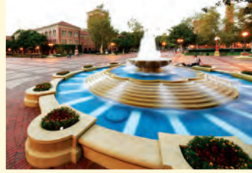
Hahn Plaza Hardscaping and redesign 2013