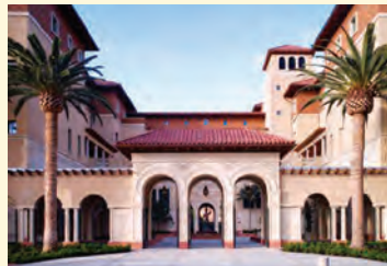
School of Cinematic Arts 62,500 square feet Groundbreaking 2011