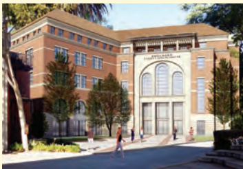
OPENED 2013 Engemann Student Health Center 100,000 square feet Groundbreaking 2011