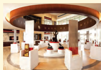
Heritage Hall 71,700 square feet Groundbreaking 2013