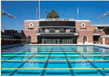
Uytengsu Aquatics Center 18,265 square feet Groundbreaking 2013