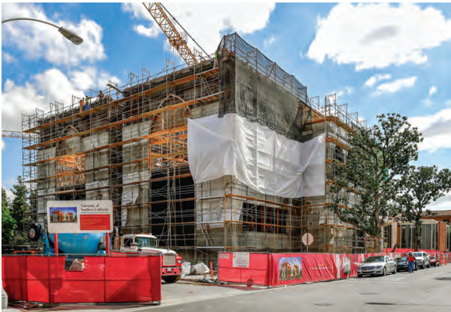
TOP: USC broke ground on the Michelson Center for Convergent Bioscience in 2014, with a target completion date of 2017. The facility will be the largest building on the University Park Campus. USC officials intend for it to serve as a hub for a regional biotechnology corridor.