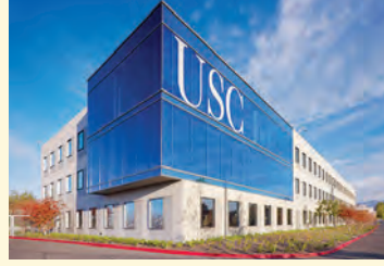
OPENED 2011 2001 Soto Street Building 120,000 square feet Groundbreaking 2010