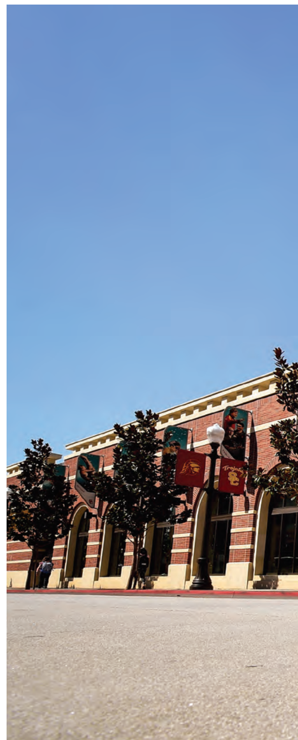
The Uytengsu Aquatics Center, upon its opening in 2014, gave USC a premier venue for its men's and women's intercollegiate swimming and diving teams and enhanced recreational and competitive opportunities for the larger academic community.

A number of donors stepped up in 2011 to provide the bulk of the money needed to build the John McKay Center, which would serve all 21 sports. Upon opening in 2012, it drew national attention for quickly transforming