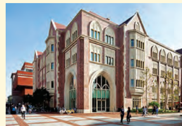
OPENED 2014 Wallis Annenberg Hall 86,000 square feet Groundbreaking 2012