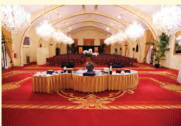
Town and Gown Interior redesign 2013