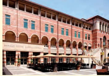
OPENED 2010 Ronald Tutor Campus Center 193,000 square feet Groundbreaking 2008