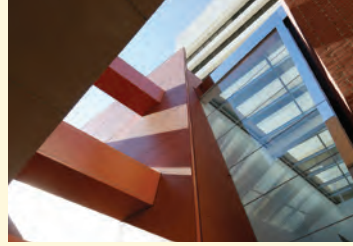
Brain and Creativity Institute (Addition, Seeley G. Mudd Building) 12,000 square feet Groundbreaking 2011