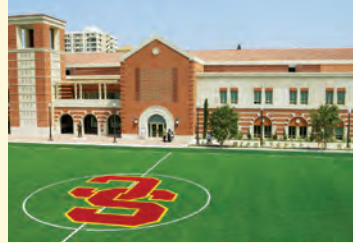
John McKay Center 103,500 square feet Groundbreaking 2011