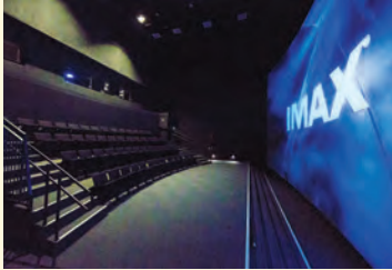
IMAX Theater and Immersive Lab (Addition, Robert Zemeckis Center for Digital Arts) 3,400 square feet Groundbreaking 2013