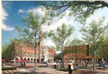
OPENING 2017 USC Village 1,200,000 square feet Groundbreaking 2014

More than two dozen major building projects have commenced at USC since 2010, transforming the landscapes of both the University Park Campus and the Health Sciences Campus.