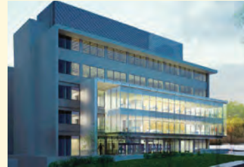
Stevens Hall 45,700 square feet Groundbreaking 2014