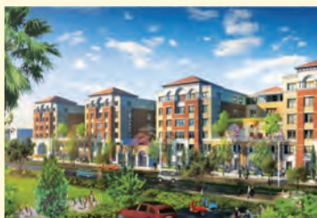
Malcolm and Barbara Currie Residence Hall 264,000 square feet Groundbreaking 2014