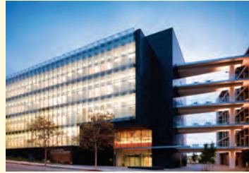
Eli and Edythe Broad Center for Regenerative Medicine and Stem Cell Research 80,000 square feet Groundbreaking 2008