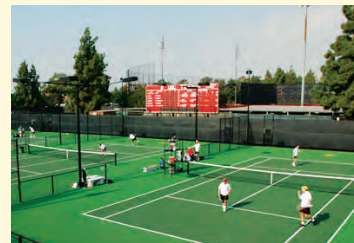
Marks Tennis Stadium 25,000 square feet Groundbreaking 2015