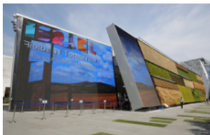
Israel The Fields of Tomorrow