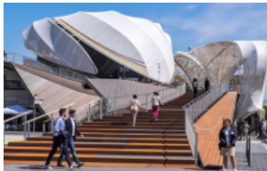
Germany Fields of Ideas