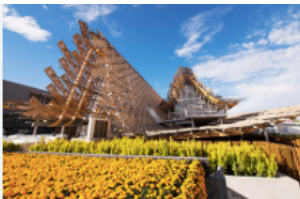
China Land of Hope, Food for Life