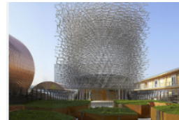
United Kingdom Grown in Britain & Northern Ireland