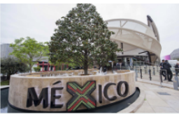
Mexico Mexico, the Seed for the New World: Food, Diversity and Heritage