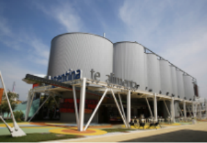
Argentina Argentina Feeds You